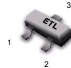
CASE 318D-03, STYLE1 SC-59